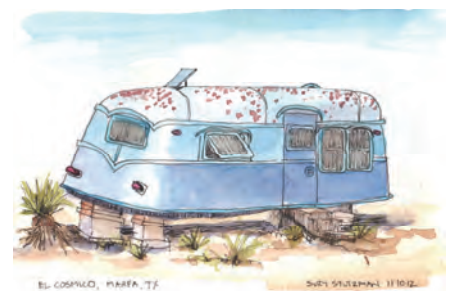
El Cosmico, Marfa, TX