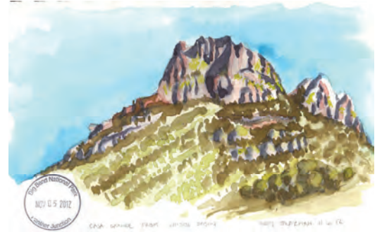
Casa Grande in Chisos Basin