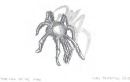
Tarantula on the Road