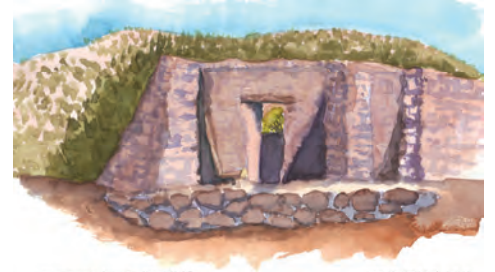
Abandoned Adobe Homestead