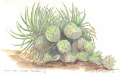
Yucca and Prickly Pear Marathon, TX