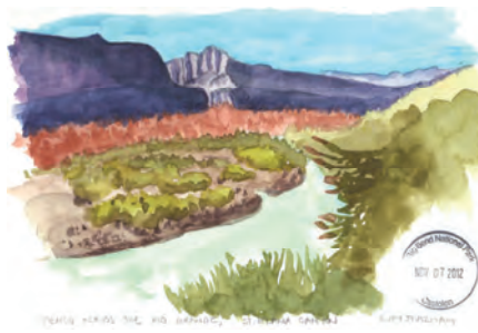
Mexico across the Rio Grande, St. Elenas Canyon