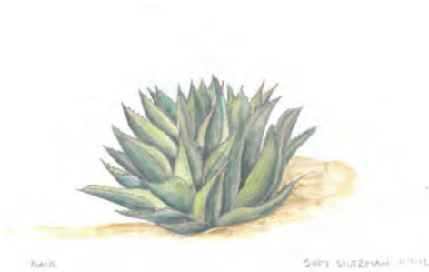
Agave, Big Bend National Park