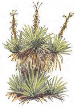
Yuccas in Stillwell